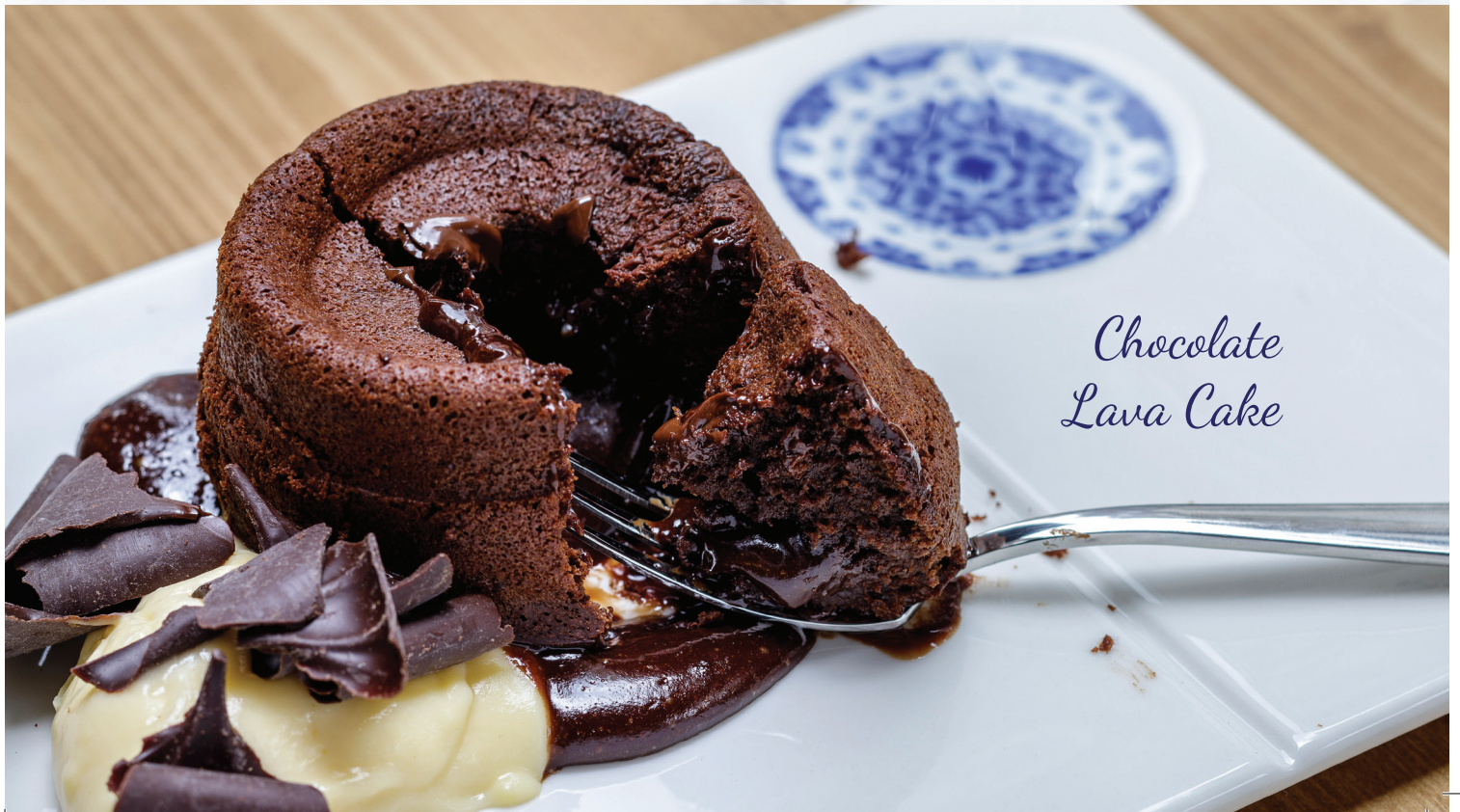
Chocolate Lava Cake

Rich and delicious chocolate molten lava cake with an ooey-goey center.