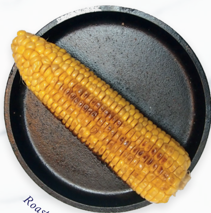
Roast Corn on the Cob