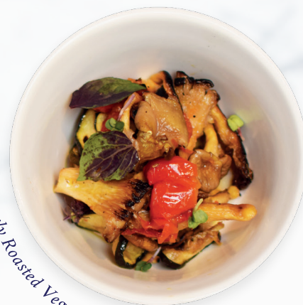
Slowly Roasted Vegetables