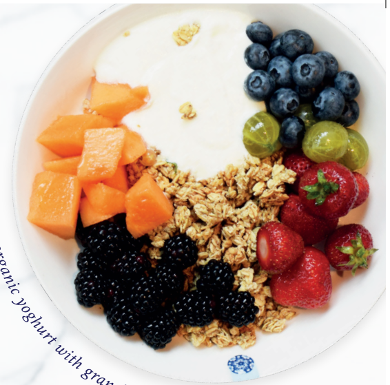
Dairy farm organic yoghurt with granola & fresh fruits